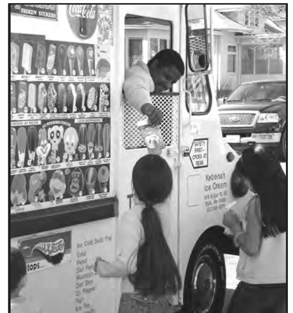
Children catch the first sign of Spring: The Ice Cream Truck! They ran with pennies and coins when they heard the familiar sounds. Look for it on a street near you!