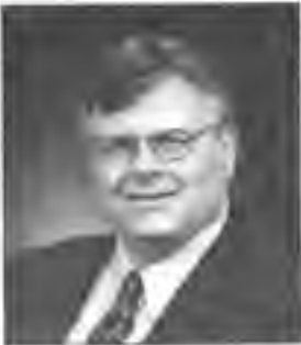
More Than 20 Years Experience