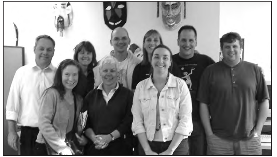
The "E-Board" members in a rare group photo in front of the festive masks on the Corcoran Neighborhood Organization wall:

Corcoran Neighborhood Minneapolis, MN 55407 fax (612) 721-7588 corcoranneighborhood.org