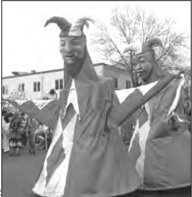
Don't miss the 31st Annual May Day Parade on May 7th! Go to www.hobt.org or stop by In the Heart of the Beast Theatre to see what all the commotion is about and why you've seen kids practice walking in stilts down your sidewalk.

A U]m] %& %& h'5bbi U'8U]b]X] ]c]b' 8U]n]7Y]W]U]h]c]b'z'&! da "' < ]g]c]f]W 5f]X; c]X]Z]Y]m]k' c]i g'z' b]Y]f' G]i'5' b]h]c]b]m]i : U]g]U]h]i b]j Y]f]g]m]i U]b]X'7'Y]b]h]U' @Y]f]b'